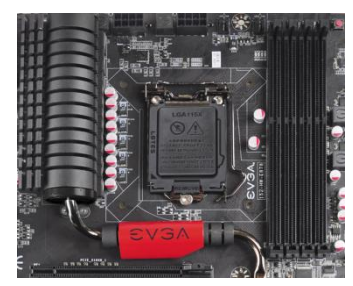
EVGA Z87 Classified

Use the following procedure to install DIMMs. Note that there is only one gap near the center of the DIMM slots. This slot matches the slot on the DIMM to ensure the component is installed properly.